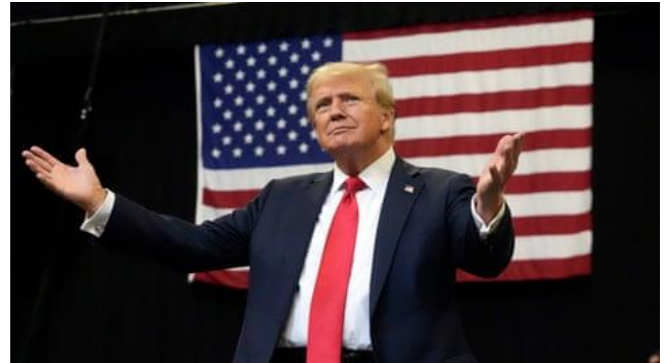
‘Trump’s rage has worked for him in the past but it is not working against Harris and Walz.’