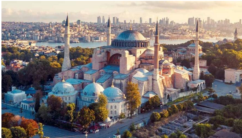
Architectural and historical wonders of Turkiye